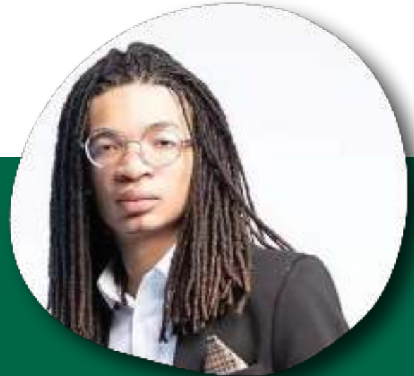
QY J. FOX

Tuition is Ivy Tech's standard tuition rate, which is the lowest in the state. In addition, students can choose to take courses within the Indiana College Core (30 transferable general education courses) or career and technical education courses (i.e., courses that lead to high-value certificates and high-wage careers).